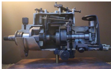
Figure 1. The Rotary Injection Pump [11]

In the first part of the study a classical application of Design FMEA has been realized for Rotary Injection Pump product. An injection pump is the device that pumps fuel into the cylinders of a diesel engine. The injection pump with rotary distributor is characterized by a single pumping element that ensures the transmission of fuel under pressure to each individual injector.